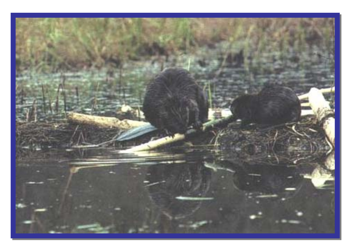
Figure 2.1: Beaver